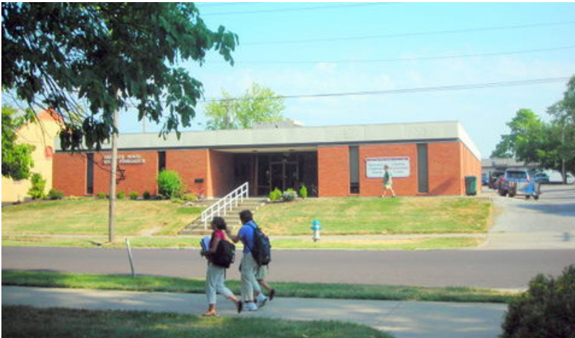
The International Community Church Co-located with the Hillel Foundation center at 1107 University Ave. on the MU Campus